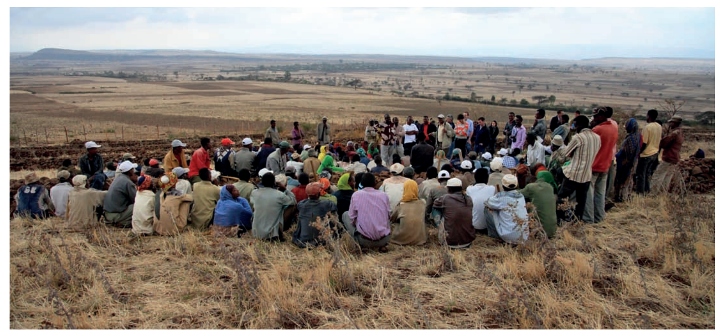
Participants of the Addis Ababa workshop visiting a Social Protection Programme in Sire Woreda, Ethiopia

While workshop participants recognised that there is a need to understand the real concerns and possible limitations of integrating SP, CCA, and DRR, there is also a need to better document the impact of synergy between the three approaches. To date, relatively little is known about how to fully integrate these communities of practice in real-life, vulnerability-reducing programmes and projects on the ground. Greater investment in research, evaluations and impact assessments is urgently required.