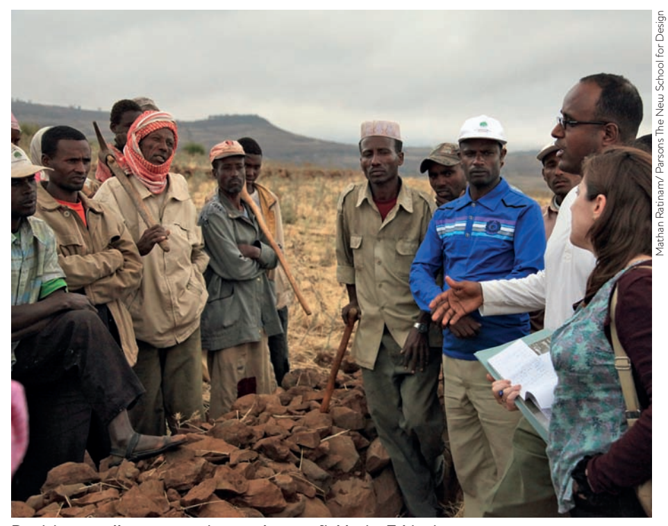
Participants talk to community members on field trip, Ethiopia

Recognising the 'political economy' of the process: The process of integration requires a good understanding and knowledge of what it means for each community. This last point led the participants of the workshop to point out the 'political economy' dimension of the process – i.e. the recognition that (re)allocations of resources are usually not free of costs and may end up creating tension or conflicts between various