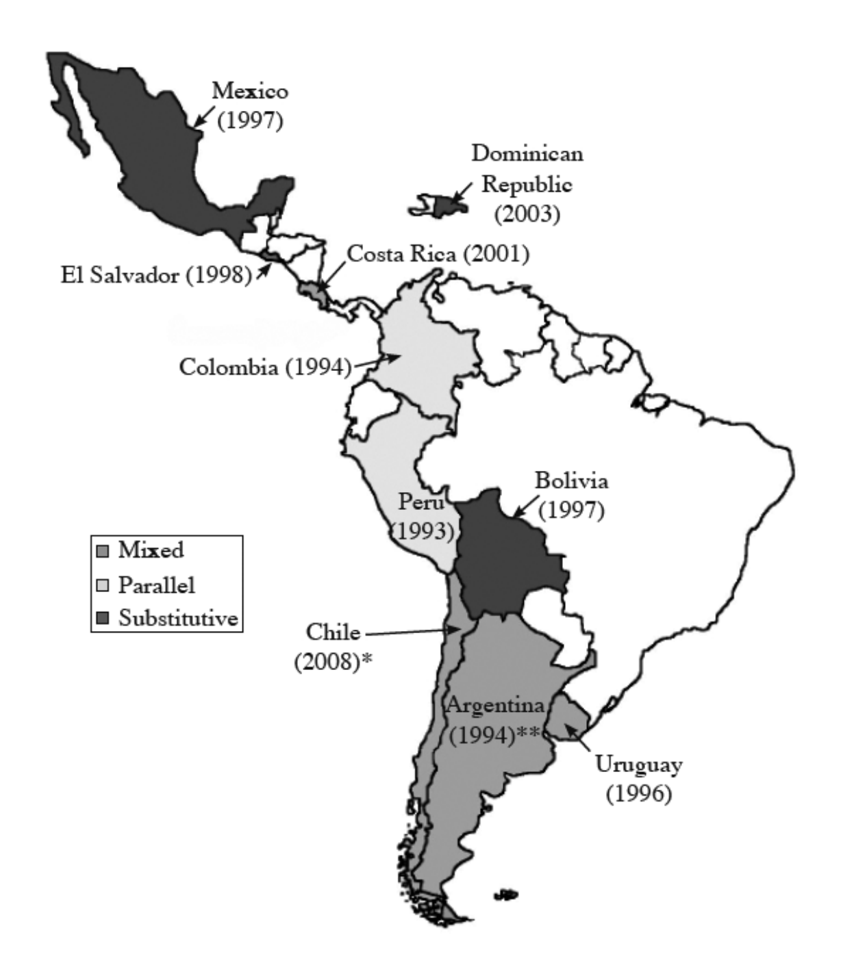
Figure 1. Structural reforms to old-age pension systems in Latin America Note: * Substitutive in 1981; ** Re-nationalized in 2008.